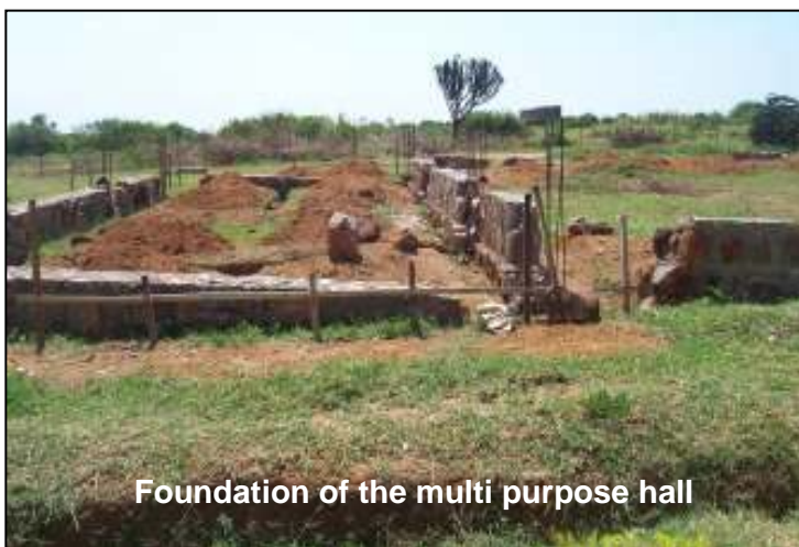
Foundation of the multi purpose hall