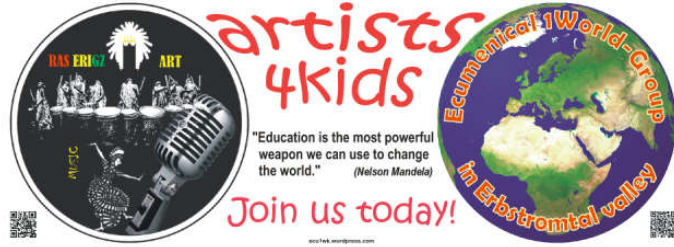
Erigz arimo gutegura Umushinga uzafasha urubyiruko

I support education of vulnerable children in Rwanda. Agree? Join me!